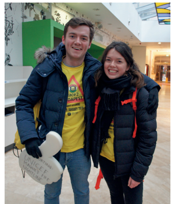
Two of the successful racers in Budapest

In the final week of the inter-semester break, 175 students set off from St Andrews in the early hours of 14 January to hitch-hike all the way to Budapest for one of the Charities Campaign's most popular projects: Race2. In teams of two or three, students rely on the kindness of other travellers to make their way across Europe and racers must check in regularly with a round-the-clock team of volunteers to ensure they are safe. This year, the winning team made it to Budapest in less than 48 hours! Race2Budapest raised £30,000 and the Charities Campaign is well on its way to smashing its previous fundraising records.