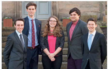
The Bobby Jones Scholars and Fellow 2015-2016 currently studying at Emory from St Andrews

The Robert T Jones Memorial Trust Scholarship was established in 1976 by friends and family of the late Robert T Jones, Jr. The scholarship seeks students who exemplify the legacy of Bobby Jones through intellectual excellence, significant leadership, and exemplary character, integrity and citizenship. Since its inception, more than two hundred students from the United States and Scotland have enjoyed the opportunities provided by this unique scholarship.